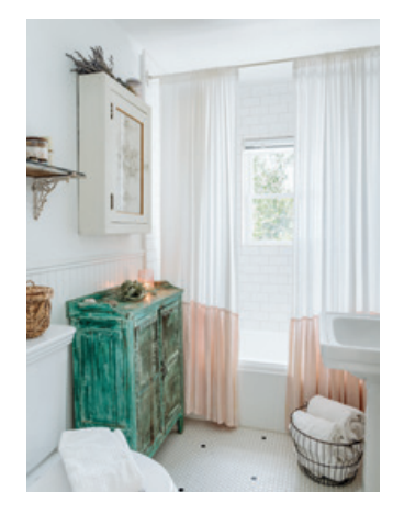
ABOVE: The bathroom needed to conceal essential items, be pretty and functional and maintain the master bedroom's romantic tone. Joanne incorporated a narrow sideboard, a vintage wall cabinet and flowing curtains.

ABOVE RIGHT AND RIGHT: The guest bedroom is all about the simplicity, comfort and charm of country life. By not setting the twin beds side by side, Joanne has freed up valuable floor space. A painting by Joanne's son Trevor and a bench-turned-side table add hints of color.