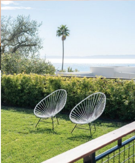
CLOCKWISE FROM TOP: Goldberg says friends know she loves a pool with chaises to lounge on; an alfresco seating area beckons the designer; a rustic urn accents the garden greenery; chairs from CB2.